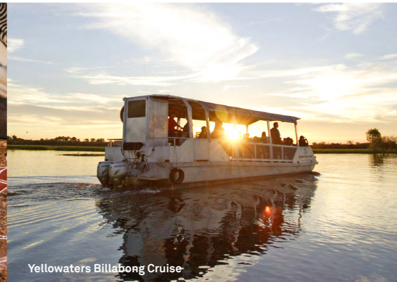
Yellowwaters Billabong Cruise