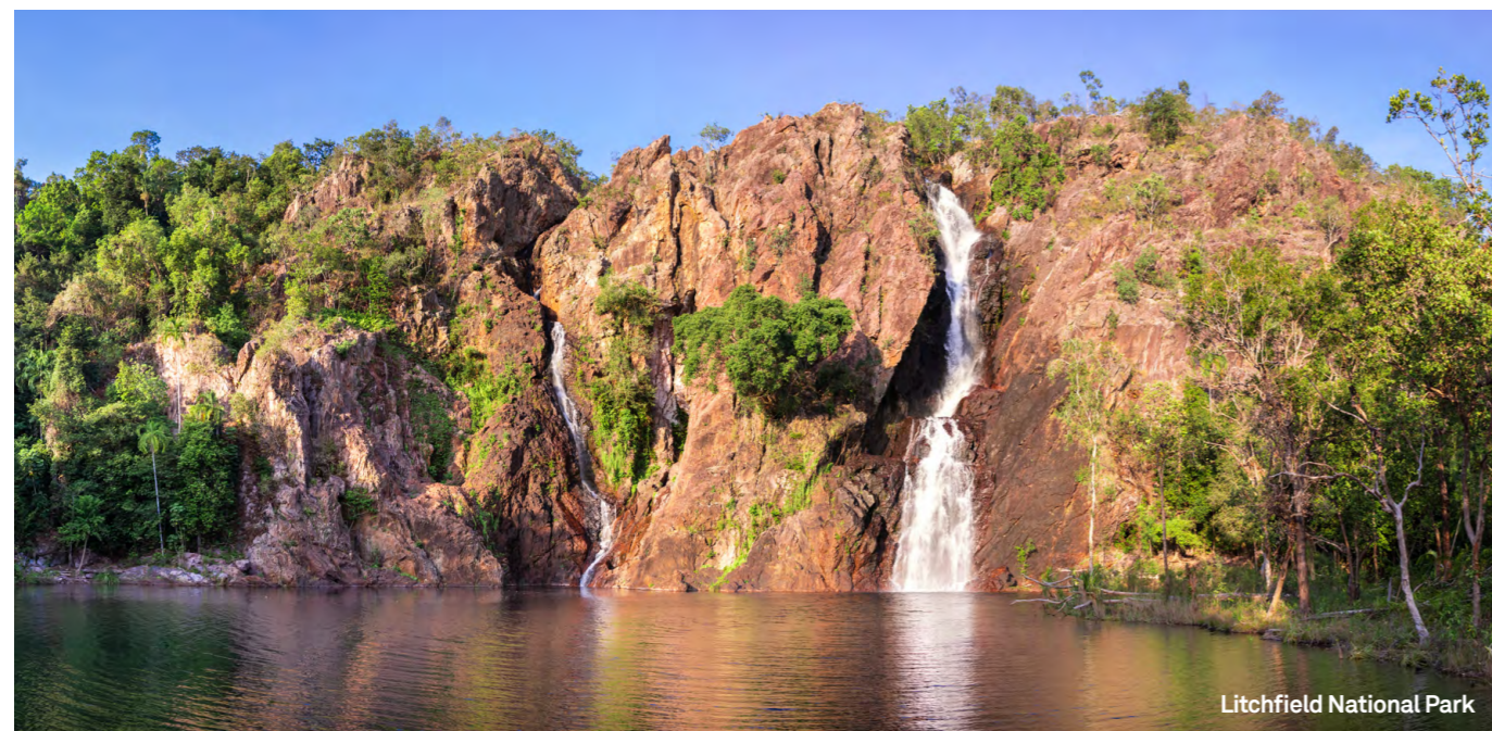
Litchfield National Park

*Alternative itineraries, please enquire for details. All prices are per person and include taxes and charges. For full terms and conditions please see scenic.com.au/terms