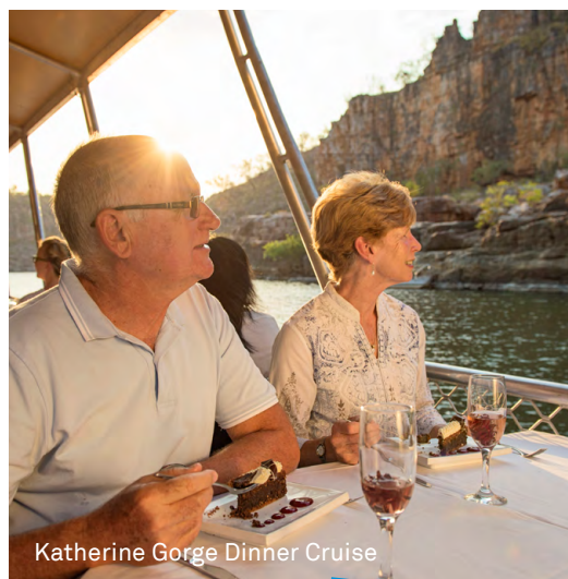
Katherine Gorge Dinner Cruise

Let the Mystical Kimberley share its many stories with you as you journey into the heart of this incredible region. Stay overnight in the Bungle Bungles and discover ancient lore and generations of stories.