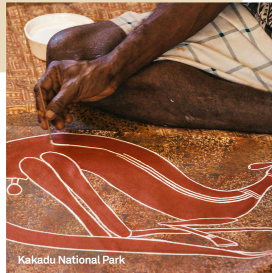
Kakadu National Park

Your Special Stay will immerse you in the 350-million-year-old Bungle Bungle Range at the Bungle Bungle Savannah Lodge. You will find one of the best stargazing spots in Australia complemented by a refreshing pool, chef-prepared meals and comfortable, private cabins designed to blend with the landscape of Purnululu National Park.