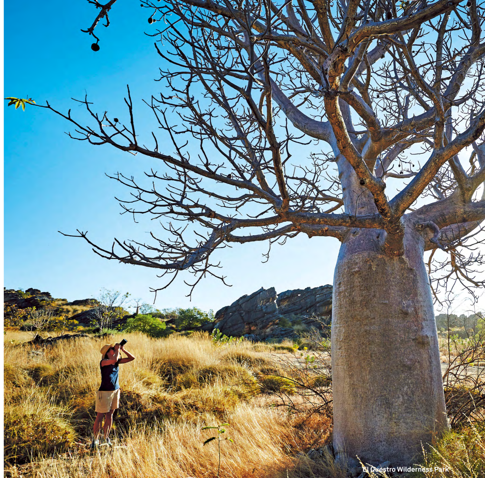
El Questro Wilderness Park